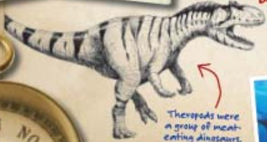
Theropods were a group of meat-eating dinosaurs, or carnivores.