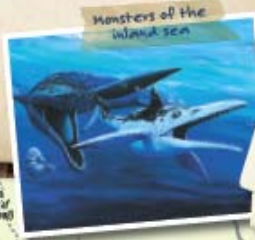
Monsters of the inland sea